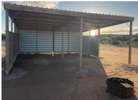
New shelter erected down at the RV Park by the Men's shed.