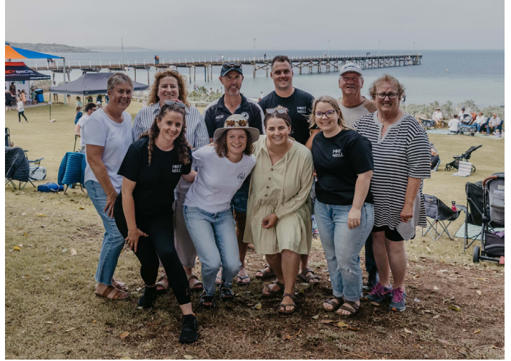
“Under the Pines Committee”